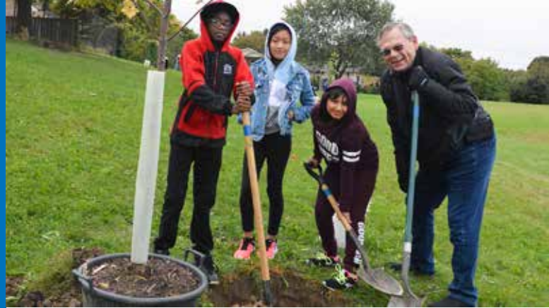
Planting large trees at the launch of the Seeds to Forest program.

Teachers told us that one of the activities they and their students enjoyed most was the site planning workshop. Through this activity, students learn about what factors to consider when thinking about planting a tree, such as soil, moisture and light conditions. Students then work in groups to determine soil type, participate in a mapping exercise, and then recommend which species of trees they think would be best for their schoolyard. Teachers appreciate this activity for all the educational opportunities it presents, but the kids love it because it helps them feel a sense of ownership and environmental responsibility. Kids love