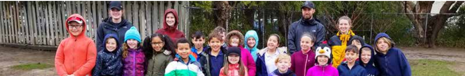
Happy students at St. Martin Catholic Elementary School.