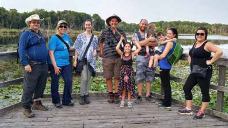
Two different groups of hikers enjoyed the view at Westminster Ponds Environmentally Significant Area (ESA) on hikes led by our newly trained hike leaders.