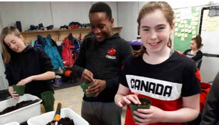
Planting acorns is a fun activity for students.

trees – and we know how important it is to provide them with real-world connections to the things they are passionate about. We hope that this program helps to nurture the tree-hugging spirit of some of our youngest citizens!