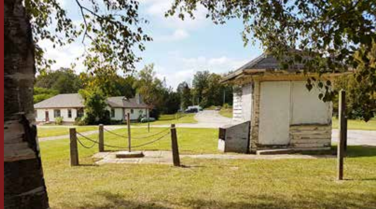
A view of the historic gatehouse that will be restored in 2019.

2019 will see the return of the popular hike training offered for ReForest London volunteers and Thames Valley Trail Association members. Also in 2019, thanks to the City of London's TreeME program, the ever-popular Tree Depots will be held at various locations across the city. Homeowners will again be able to get free trees to plant in their yards and of course register them in the Million Tree Challenge.