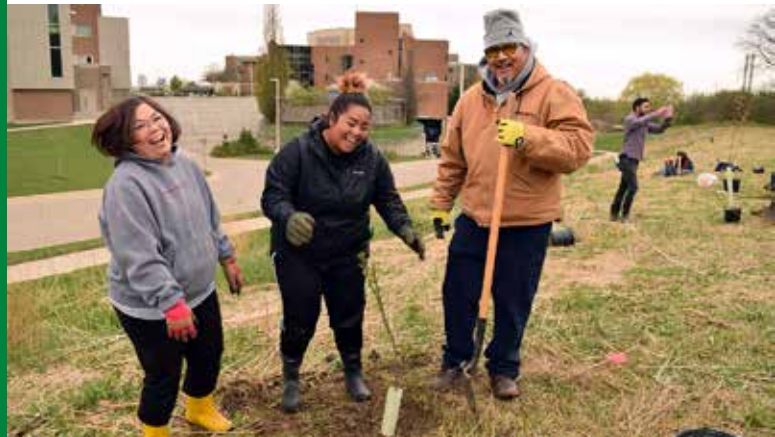
Family members have fun planting in Celebration Forest.