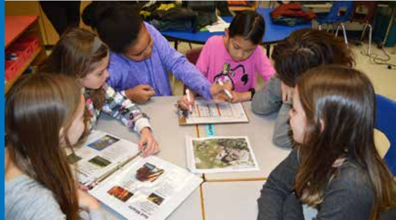
Students take part in a site planning workshop.