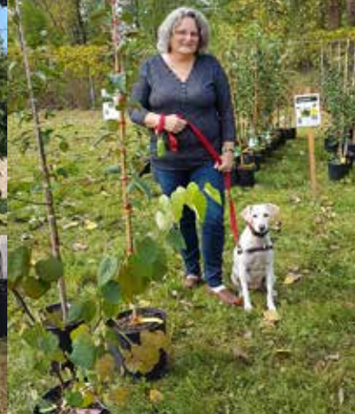
Tree recipients (left) at Forked River Brewing Company’s tree depot, and choosing Redbuds on National Tree Day at the City of London’s Exeter Road Tree Depot.