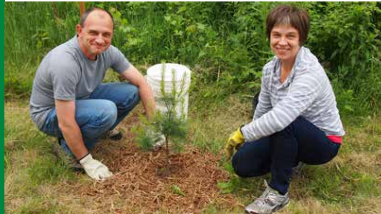
Happy Canada Life volunteers plant a White Pine at Sovereign Woods!