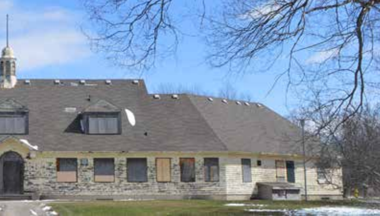
Ponds Centre site and will be restored to its former glory for our community.