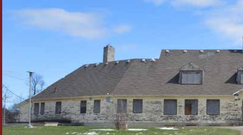
The beautiful and impressive Wellington Pavilion is the jewel of the Westminster A fall view of the Bruce Pavilion on the Westminster Ponds Centre site.

The Centre will be a catalyst for environmental change in our community. It will focus on making our