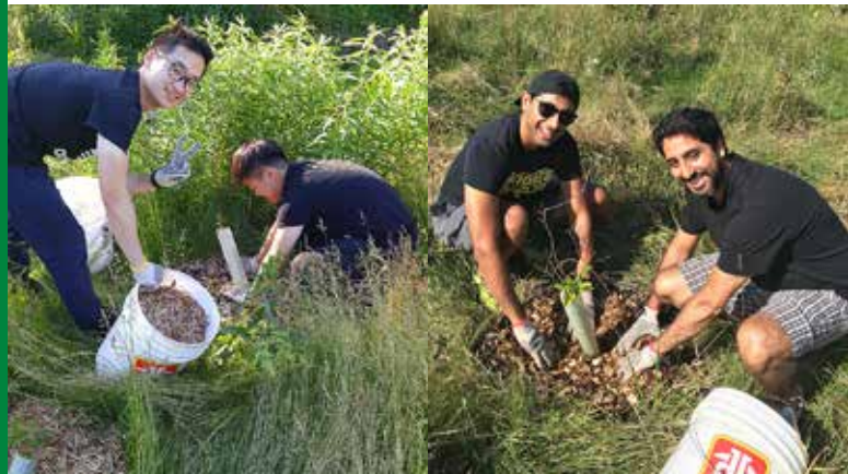
Aftercare at Southwinds Park (left) and West Lion's Park.