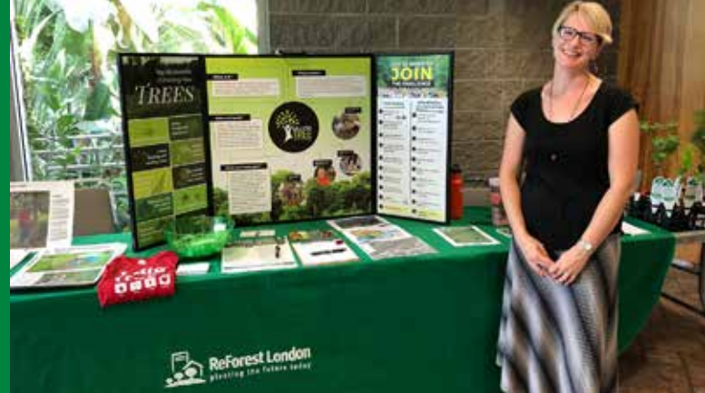
Spreading the word about ReForest London at Doors Open.

During 2018, we made sure to tell our volunteers how appreciated they are. We held two volunteer appreciation events that each attracted many volunteers. These included a winter event with a free brunch, nature hike and movie screening in