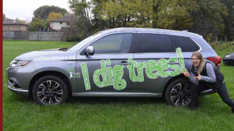
Robinson Mitsubishi became an active MTC Partner in 2018 in part to promote their new, greener Outlander, a plug-in hybrid electric vehicle. STIHL Ltd. Canada sponsored a large tree giveaway on National Tree Day.

Platinum level MTC Sponsor, the Richard and Beryl Ivey Fund (a fund within the London Community Foundation) continued to lead support and Cornerstone Architecture continued their Silver sponsorship for a second year. We gained some great new support including Silver sponsors Old Oak Properties, M&T Printing Group, and Robinson Mitsubishi, and Bronze sponsors Renewi Canada and Bimbo Canada.