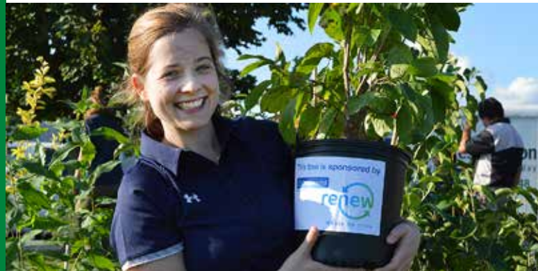
Renewi Canada funded and hosted a large tree depot at their offices in 2018.