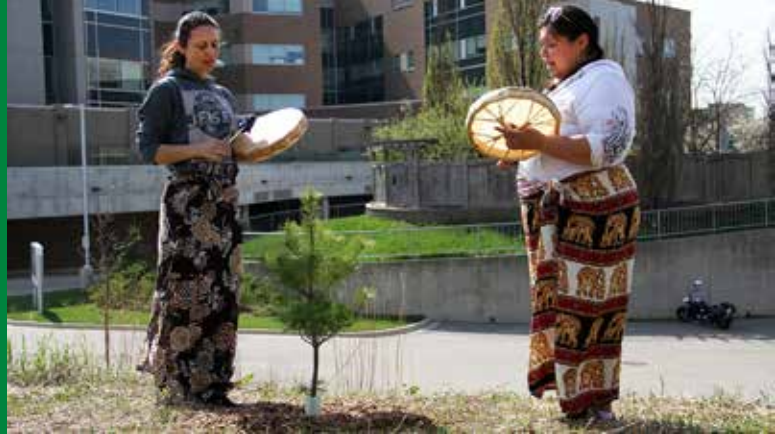
Indigenous planters hold a drumming ceremony for their tree.

Thank you to event sponsors Horizon Leadership and TLC Landscaping for their generous support.