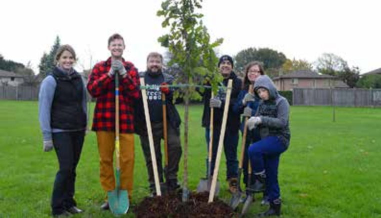
MTC Silver sponsors Old Oak Properties, planted a large oak at Cheswick Park. M&T Printing Group hosted a reception with Chuck Leavell (centre), tree farmer & tree advocate and keyboardist for The Rolling Stones!