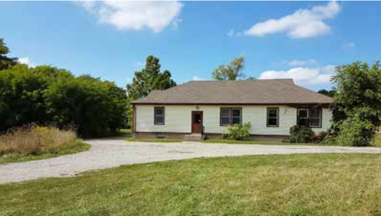
A sunny summer view of the Perth Pavilion on the Westminster Ponds Centre site.

community more sustainable, stimulating deep and ongoing partnerships and collaborations within the environmental sector and more importantly with those in other sectors. Sustainability reaches across many aspects of our community life.