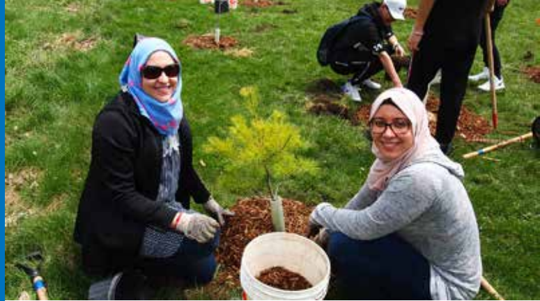
Many people enjoyed 'putting down new roots' at Huntington Park.

On a sunny September Saturday, to kick off the fall planting season, over 120 volunteers from Western Orientation Serves, CN, CN Police, CN Pensioners and the 84 th Scouts Group joined us at Somerset Woods in Byron to plant 450 native trees and shrubs. This project was generously supported by CN through the CN EcoConnexions program, Tree Canada and the Ontario Ministry of Natural Resources and Forestry (Land Stewardship and Habitat Restoration Program). This was the first of 12 fall park plantings across the city that were