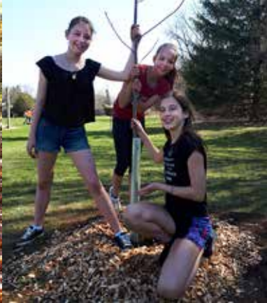
Students enjoy a hike (left) and planting a large tree (right).