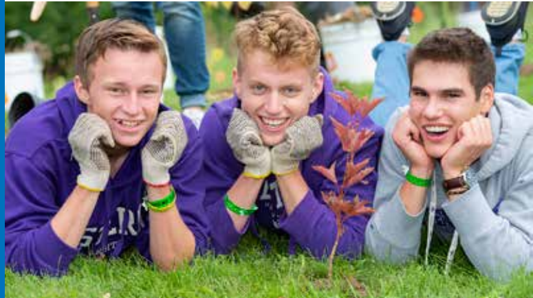
Western University students planted hundreds of trees at Somerset Woods.