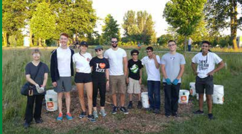
A happy group of aftercare volunteers at Virginia Park.

In 2018, we worked with 266 volunteers and six organized volunteer groups to perform aftercare activities at 23 projects planted one to two years ago across London. It's always a wonderful way to spend a summer evening, listening to music, enjoying a popsicle and making new friends.