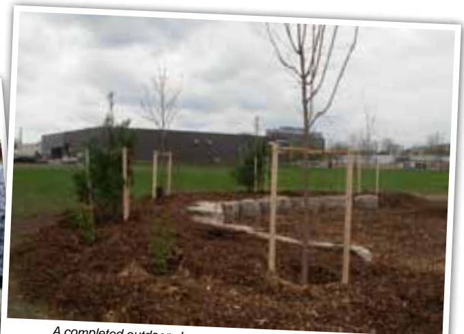
A completed outdoor classroom at Princess Elizabeth School is ready for learning and fun.