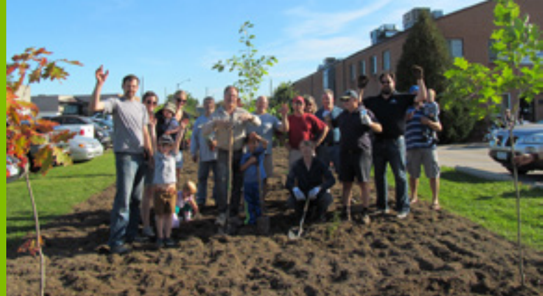
Above: Industrial land planting at Rapid Binding & Laminating and Longo Custom Kitchens, September, 2014.

We also completed a series of plantings on industrial properties, thanks to partners such as London Life, Longo Kitchens, Rapid Binding and Laminating, TRY Recycling and Labatt who opened their lands for planting, creating spaces for employee breaks, improving their properties, and creating a more sustainable future.