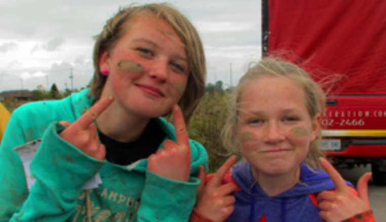
Above: Happy, muddy volunteers, Veterans Memorial Parkway naturalization, 2014. Below: McCormick Park naturalization with Canon, 2014.