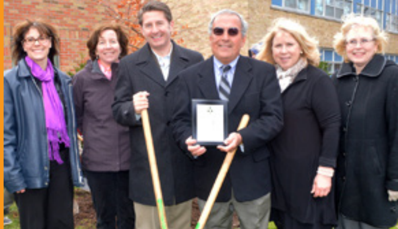
Above: Launch of the School Community Tree Challenge, Earth Day, April 2014 at Catholic Central High School. Below: Schoolyard planting at Northbrae Public School, June 2014.

Five Secondary and fifteen Elementary schools were selected as Challenger Schools. With the support of ReForest London and the UTRCA, 47 tree projects have been implemented and planned for the 2014/2015 school year, involving over 4000 volunteers. More than 5000 trees will be planted, grown, sold or given away through this year, making for a huge impact in our first year of the program.