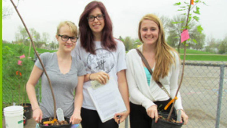
Above: Saunders Secondary School Tree Sale, May 2014. Below: Western Fair 2500+ seedling giveaway, September 2014.

This year, we gave away over 9,100 seedlings at 20 events across the city. We held ten tree sales, four of them in low income neighbourhoods with lower prices on trees. These baby trees will one day become the neighbourhoods' sentinels of future generations. We thank the Ontario Trillium Foundation, London Community Foundation, and the City of London for supporting these programs.