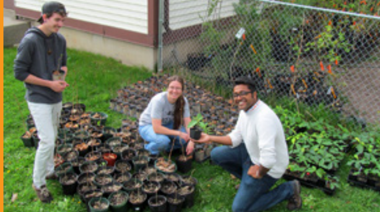
Above: Londoners donated 227 trees to the Challenge at Treecycle, spring and fall, 2014, Below: MTC Partner Eastforest Homes did a seedling giveaway, May 2014.

It was a year of collaboration, engagement organizing, increased diversity, development and growth helping to move London closer to the green legacy this project envisions. The tree counter kept increasing with a total of 237,266 trees registered by Londoners for a healthier Forest City.