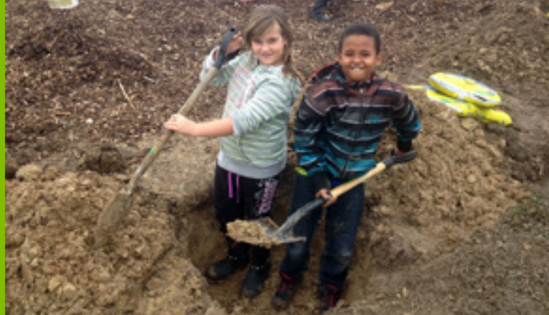
Above: Cartier Public School students enjoy digging a tree hole, October 2014. Below: CCH students create their outdoor classroom, May 2014.

We gratefully acknowledge the support of the Walter J. Blackburn Foundation, the Arcangelo Rea Foundation, and the many school staff and families in London who helped to fundraise for and install these healthy schoolyard features.