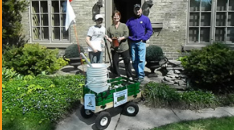
Above: A Tree Captain gives a tree to a neighbour, May 2014. Below: A resident happily waters his new Neighbourhood Tree Captain planted tree, June 2014.

A new activity in 2014, the Green Wagon Program, saw Tree Captains take wagon loads of native trees to their neighbours' doors and offer to plant them right then and there. In the first year, 85 seedlings/saplings found new homes through this initiative. Captains also gave out ten tree watering kits. Wagons were also great at community events to raise awareness of this grassroots program.