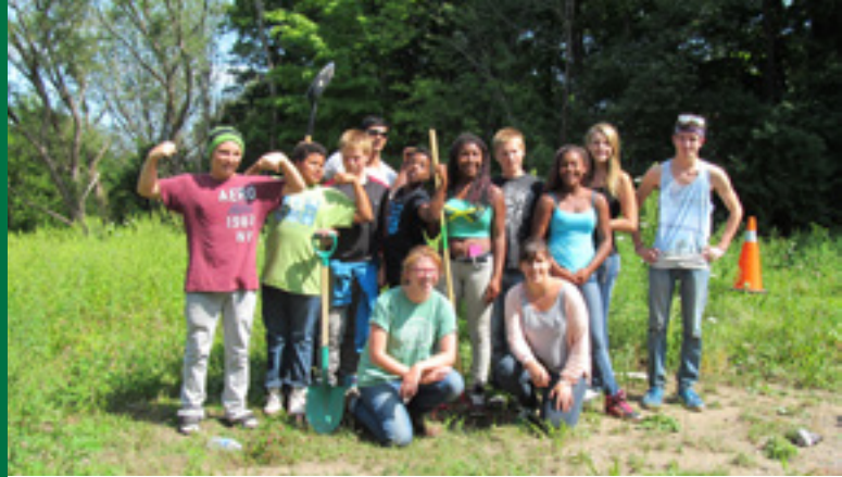
Above: Aftercare volunteers from the London Community Chaplaincy at Thompson Road Park, August 2014. Below: A Toast to Trees Event Committee, October 2014.

There are many ways you can volunteer with ReForest London to spread the message of the importance of trees. Other benefits of volunteering include meeting like-minded individuals and learning valuable, often transferable skills.