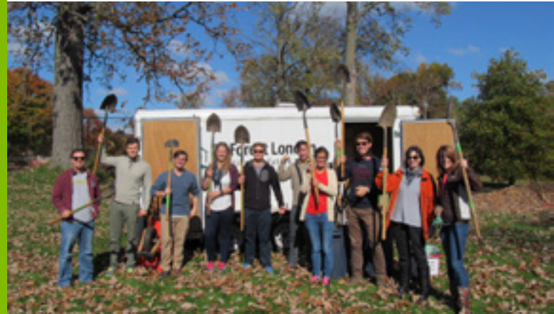
Below: Gibbons Park naturalization with Ivey students, October, 2014.