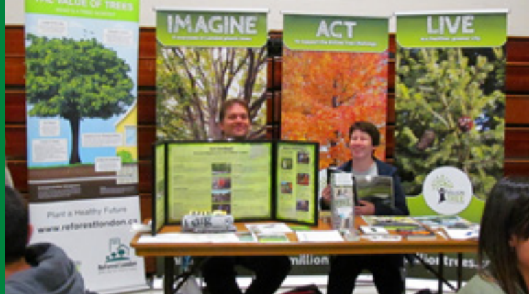
Above: Environmental Symposium, TVDSB Education Centre, October 2014. Below: Gathering on the Green, June 2014.

ReForest London participated in events such as Western's EnviroWeek, Trails Open, Our Street, LSTAR AGM and Trade Show, London Spring Home and Garden Show, Seedy Saturday, the Western Fair and many more! In total, ReForest London volunteers gave away over 9,100 seedlings to Londoners, and encouraged them all to register their trees online to count toward London's Million Tree Challenge.