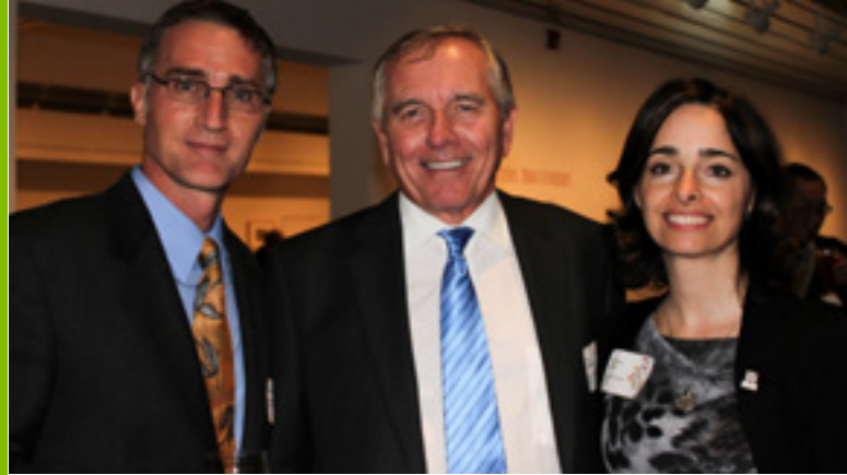
Above: ReForest London Board members at A Toast to Trees. Below: Million Tree Challenge co-founding Partner, the City of London, gave away saplings on National Tree Day.

1000 seedlings were given away at the Forest City Road Races who designed their finishers medal with a tree, as a nod to the Million Tree Challenge. For the first time, Partners sponsored $2,500 worth of seedlings given away at the Western Fair. National Tree Day 2014, enjoyed success again with 16 Partners giving away 1853 seedlings/saplings at 32 public locations and five private locations (internal giveaways).