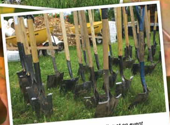
Shovels were ready for planting at an event sponsored by the London GM dealers along Veteran's Memorial Parkway in the fall.