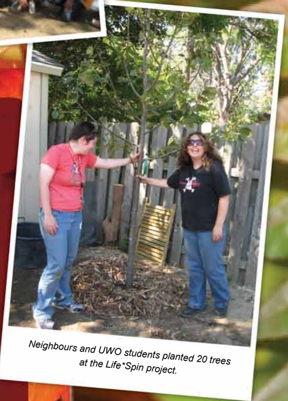
Neighbours and UWO students planted 20 trees at the Life*Spin project.

One neighbour rode by on his bike and stopped by to plant a tree in memory of his mother who had recently passed away. The parkette is now enjoyed year-round by the community.