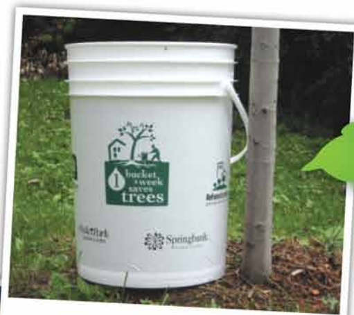
500 tree watering kits were delivered to Londoners this year.