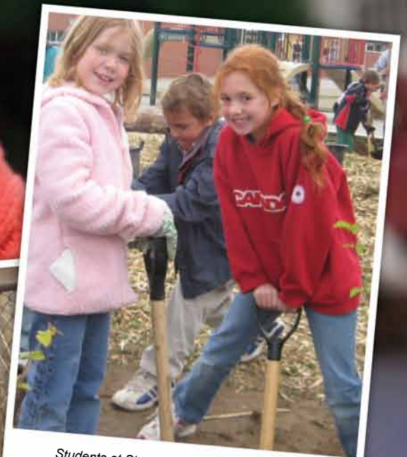
Students at St. George Catholic School help plant and water their new trees.