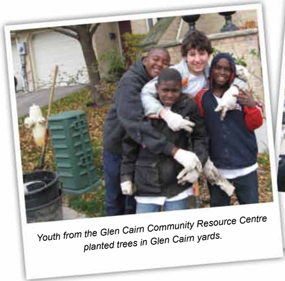
Youth from the Glen Cairn Community Resource Centre planted trees in Glen Cairn yards.