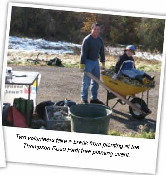
Two volunteers take a break from planting at the Thompson Road Park tree planting event.

Launched this year, Neighbourhood Re-Leaf is a focussed program to “reforest” all aspects of a selected neighbourhood. Throughout the fall of 2008 and spring 2009, 1,000 trees will be planted in backyards, city boulevards, schools, businesses, places of worship, parks and other public areas in Glen Cairn.