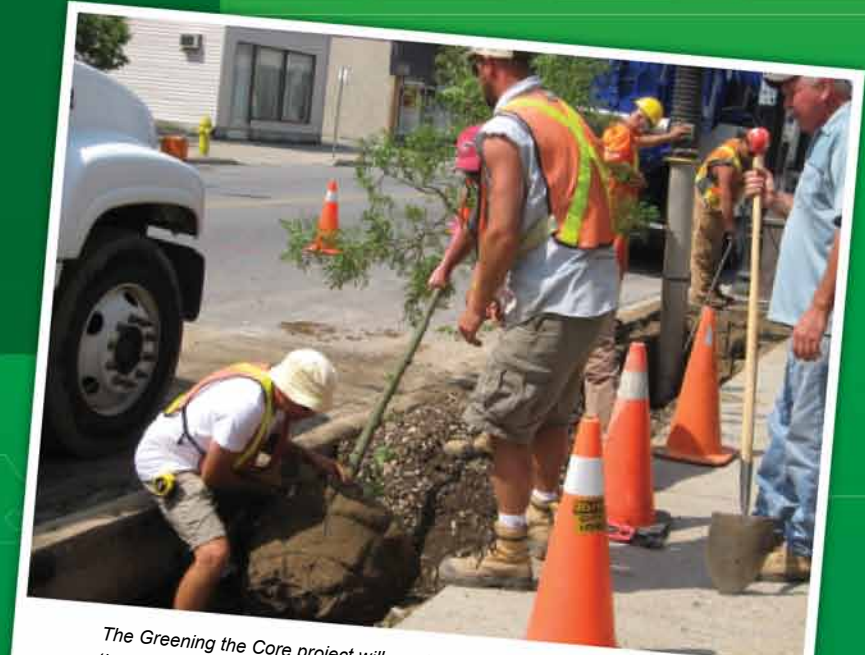
The Greening the Core project will employ structural soil, a planting method that reduces compaction, as shown in this Old East Village project this year.